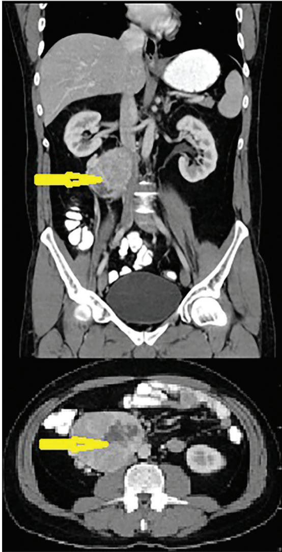
Figure 2. CT image of a 92×87 mm 2 , irregularly shaped, contrast-enhanced mass detected in the precaval and aortocaval areas at an infrarenal level contiguous with the duodenum.

The parameters of the spermiogram test were normal. Contrast-enhanced CT detected an irregularly shaped mass measuring 92×87 mm 2 in the precaval and aortocaval areas at an infrarenal level contiguous with the duodenum ( Figure 2 ). Although the mass was compressing the inferior vena cava (IVC), no invasion was detected.