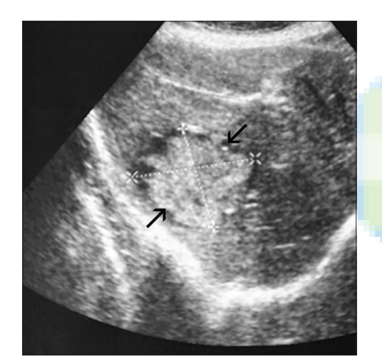
Figure 1: Abdominal ultrasonography showed a hepatic mass on segment 8. This lesion displayed an isoechoic pattern with a surrounding hypoechoic halo (arrows)

Extramedullary plasmacytomas (EMPs) are uncommon, and most are found in the lungs, oronasopharynx, or paranasal