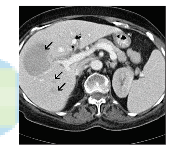
Figure 2: Post-contrast computed tomography at the level of the portal hilus scan (portal phase) demonstrated multiple hypovascular and hypodense lesions compared with normal liver parenchyma (arrows)

Generally, including in our case, these lesions are defined as having a hypovascular pattern. Matheiu et al. ,<sup>[4]</sup> described a case where the dynamic CT finding of peripheral enhancement with gradual filling-in toward the center of the lesion is very similar to those encountered in