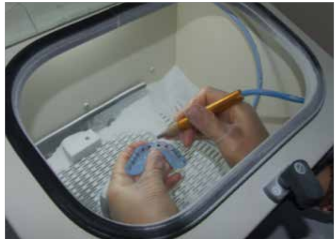
Figure 4. Sand blasting of composite custom bases