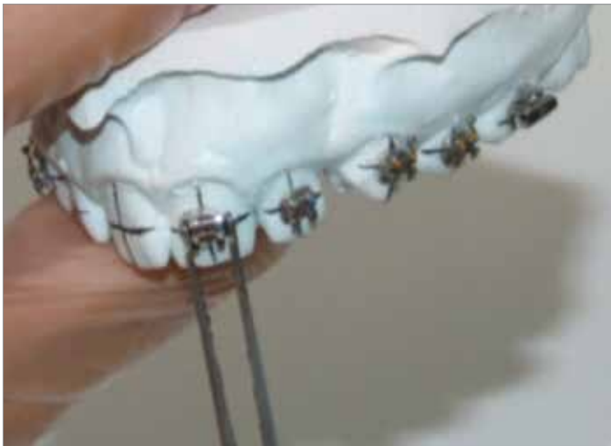
Figure 2. Bonding of brackets to the stone model