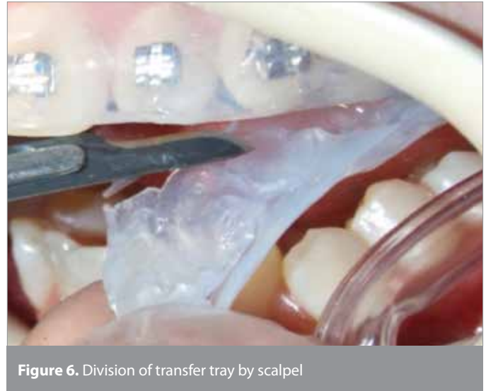
Figure 6. Division of transfer tray by scalpel