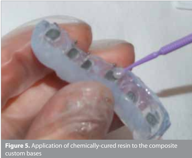
Figure 5. Application of chemically-cured resin to the composite custom bases