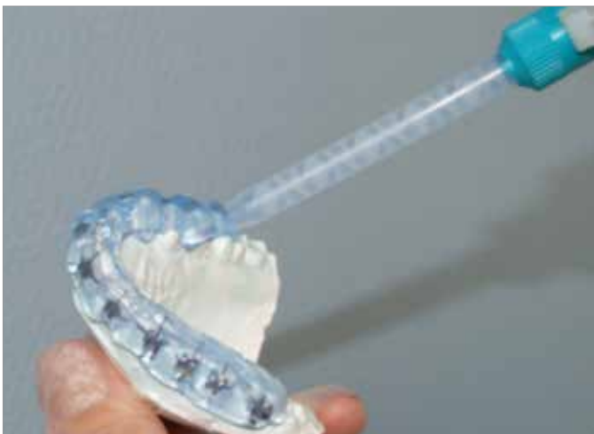
Figure 3. Fabrication of transparent transfer tray

recommendation of the manufacturer. If a thermally-cured resin is used, the model must be put in an oven of 120-170°C temperature for 15 min for the polymerization (2). For the light-cured resin, a light-emitting diode (LED) curing light must be used from mesial and distal surfaces for an additional 10 s for each tooth as the stone model does not reflect light like enamel.