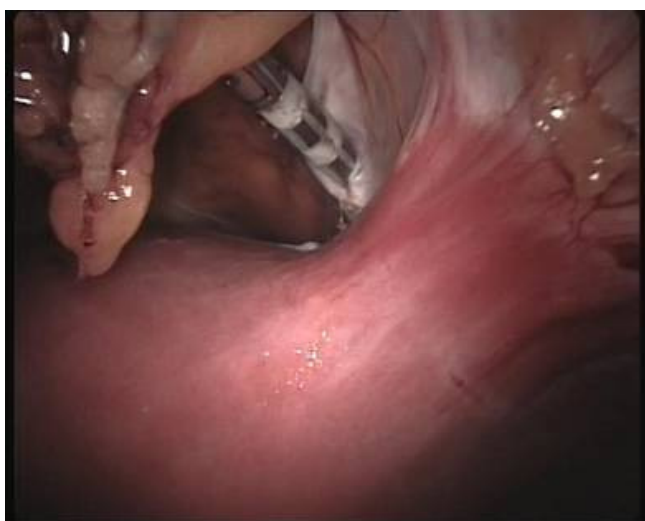
Figure 6. (pelvic adhesions)

In two cases during TLH, a decision to convert to laparotomy was made due to inadequate exposure caused by the location of a single giant myoma blocking the view required for vesico-uterine peritoneal dividing. There were 2 intra-operative complications in the TLH series, bladder damage during vesicouterine peritoneal dividing was