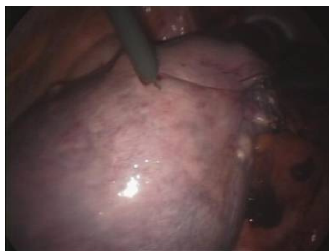
Figure 3. (giant uterus)

Largest uterus in the TLH series was 1550 grams (Figure 3,4).