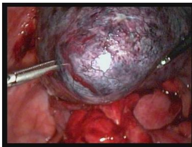
Figure 7. (torsioned dermoid cyst in hysterectomy)