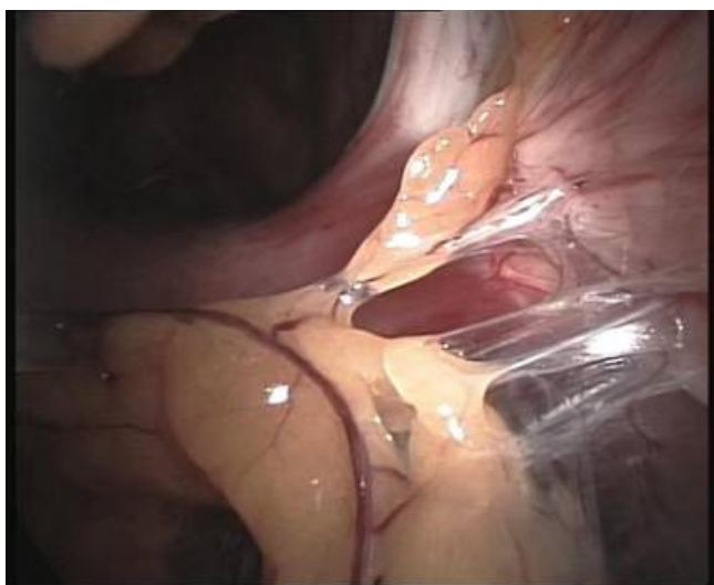
Figure 5. (pelvic adhesions)