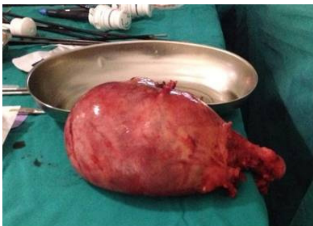
Figure 4. (giant uterus)