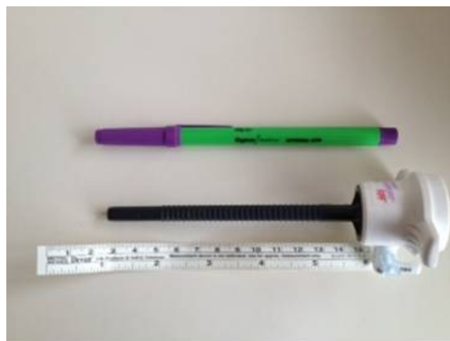
Figure 1. (instruments used to take the measurements)

To obtain objective measurements during abdominal entry the suprapubic port was used to visualize and take the measurements and a trocar (Figure 1) was used as a ruler.