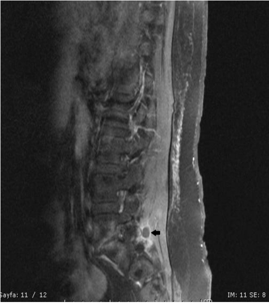
Figure 3. Contrast enhanced MR image shows peripherally enhancement of fluid collection compatible with posterior aspect of spinal canal (black arrow).

Postoperative Spondylodiscitis and Epidural Absces