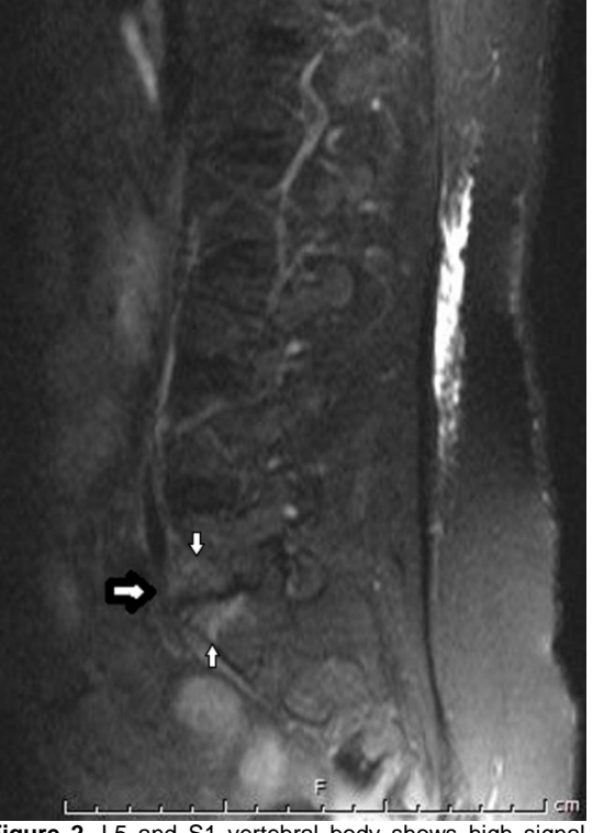
Figure 2. L5 and S1 vertebral body shows high signal intensity on T2-weighted image (white arrows)