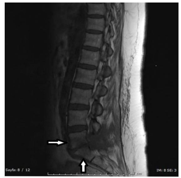
Figure 1. L5 and S1 vertebral body shows low signal intensity on T1-weighted image (white arrows)

L5 and S1 vertebral body and intervertebral disk showed rim like contrast enhancement after contrast administration (figures1-2-3-4). Patient went operation. The main micro-organisms were staphylococcus aureus in the culture. After operation, she received antibiotherapy and was still alive and healthy after surgery.