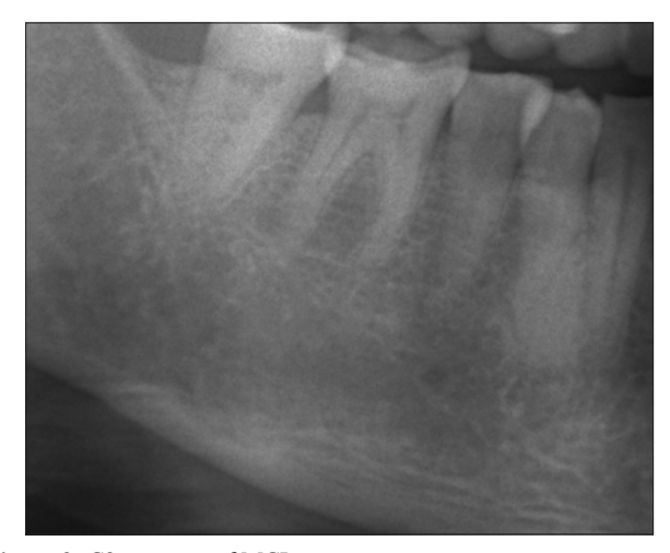
Figure 2: C2 category of MCI

PMI is the ratio between the cortical width at the mental foramen region and the distance from the lower border to the inferior edge of the mental foramen (MI/h) [Figure 4].<sup>[37]</sup> A few studies investigated the accuracy of PMI in detecting reduced BMD. These studies considered the threshold value of 0.3 and the estimated sensitivity and specificity was higher than 70%.<sup>[8,20,38]</sup>