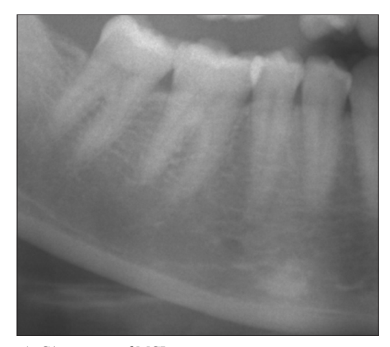
Figure 1: C1 category of MCI

MCI or KI refers to the appearance of the inferior cortex of the mandible and is classified as follows: C1: the endosteal margin of the cortex is even and sharp on both sides [Figure 1]; C2: The endosteal margin presents semilunar defects (lacunar resorption) and/or appears to form endosteal cortical residues on one or both sides [Figure 2]; and C3: The cortical layer forms heavy endosteal cortical residues and is clearly porous [Figure 3].[17] Some studies have reported that women with a mild to moderate and severe eroded cortex are considered to have an increased likelihood of osteoporosis.[1,11,18-20] However, others indicated no usefulness of the MCI.[8,21,22] A recent study showed that approximately 95% of Japanese women identified by trained dentists using cortical shape findings did have osteopenia or osteoporosis.<sup>[14]</sup> As a result, studies concluded that the sensitivity of MCI in the diagnosis