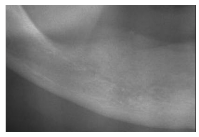
Figure 3: C3 category of MCI