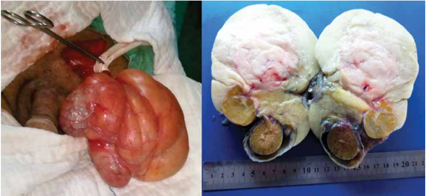
Figure 1. Macroscopic appearance of paratesticular mass during surgery (on the left). Macroscopic cut view of the specimen (on the right)