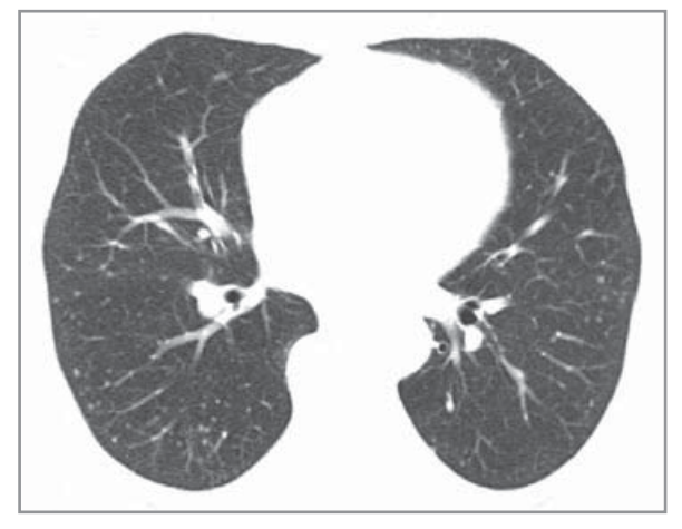
Figure 1. Multiple, 1-4 mm, randomly distributed bilateral micronodular lesions on axial 5 mm thoracic CT scan.

The patient showed normal spirometry and carbon monoxide diffusion capacity, but slightly decreased total lung capacity (71%). Current computed tomography (CT) of the thorax at the time of admittance displayed diffuse, multiple, randomly distributed 1-4 mm nodular lesions in the parenchyma of both lungs (Figure 1). The patient had been followed by thoracic CT scan in another center and there had been no radiological difference for one and a half year period. She had been referred to our hospital for definitive diagnosis. As the nodules were small, have no bronchus sign and revealed no endobronchial lesion on thoracic CT scan she underwent video-assisted thoracoscopic surgery (VATS) for its higher diagnostic yield than other conventional diagnostic procedures such as bronchoscopy or transthoracic needle biopsy. Nodular configurations, which were also seen on