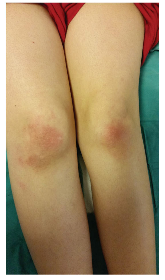
Figure 1. Bilateral erythematous patches on the knees