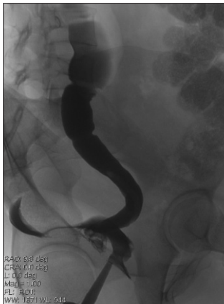
Figure 3. Contrast-injected lateral colonography performed at the third month reveals the loss of the plug and a recently developed presacral blind-ended fistulous tract.

First-line treatment options for this patient include palliative colostomy and surgical repair. An alternative method could be the use of an occlusion device designed for nonsurgical treatment of patients with acquired RVF, as reported by Lee et al. (4). Although this device is reported to have