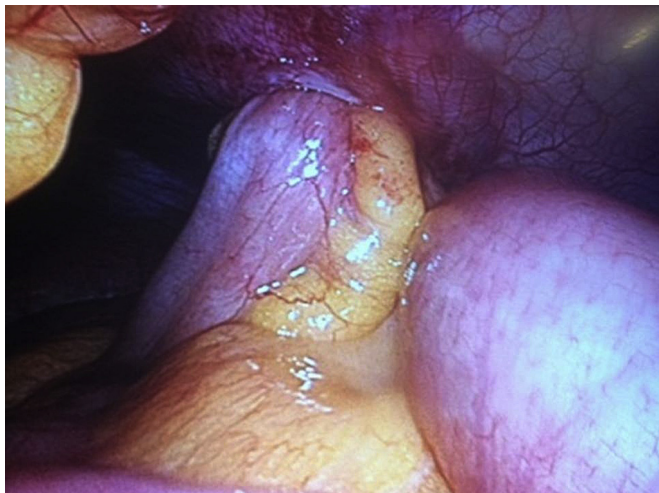
Fig. 3. Laparoscopic view of bowel herniation penetrating peritoneal layer at the time of correction surgery.

Owing to design differences, the 8-mm cannulas used during robotic surgery produce a more pronounced defect in the fascia than those used for traditional laparoscopy. Surgeons who regularly perform these minimally invasive procedures generally do not attempt to close the fascia of ports less than 10 mm, including the 8-mm robotic ports, because of the technical difficulties associated with closing smaller port fasciae. 3