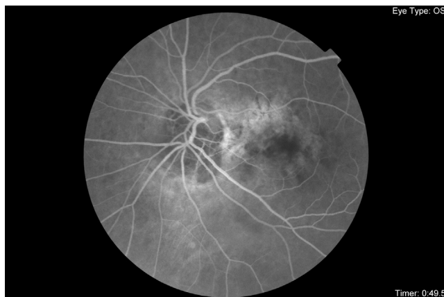
Figure 2. Fundus fluorescent angiography: vascular kink on pseudoduplication.

showed inferior retinal artery and vein making a kink on pseudoduplication (Fig. 2). Visual field test was not performed due to the poor sight of the left eye. Although the lesion showed bridging of retinal vessels, no doubling of retinal artery and no late hyperfluorescence expected from a