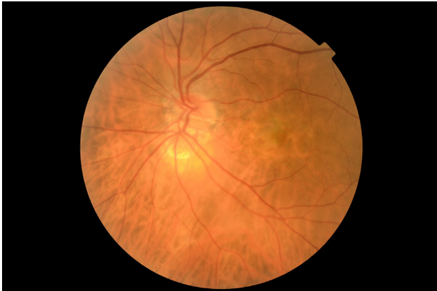
Figure 1. Fundus colour photo of the left eye: Tilted optic disc with the inferionasal pseudoduplicated disc.