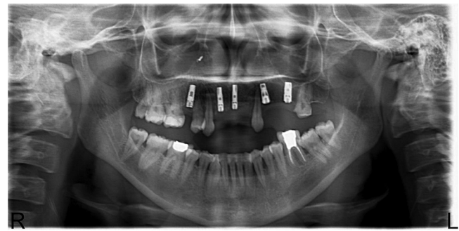
Fig. 3. Three months later from implant surgery, there were no radiographic complications. The patient also received maxillary premolar and molar implants.

the distractor was placed on the right maxillary canine region, not in the midline. Right arm of the lower distractor plates (i.e., the one on the moving segment's side) was cut off in order to make the device fit into its place.