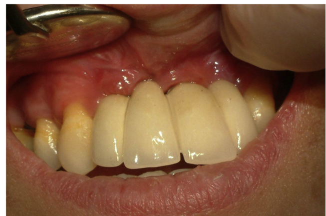
Fig. 4. The implants were loaded after six months with a fixed prosthetic restoration.

The implants were left to integrate for three months (Fig. 3). However, in the second stage surgery it was seen that the right implant exposed through the soft tissue. The area was surgically exposed and a bone defect of several millimeters on the buccal