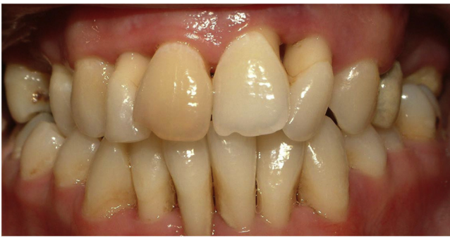
Fig. 1. Maxillary four incisors were found to be grade 3 mobile according to Miller's classification.

treatment time, little or no resorption of bone, and fairly predictable results [1].