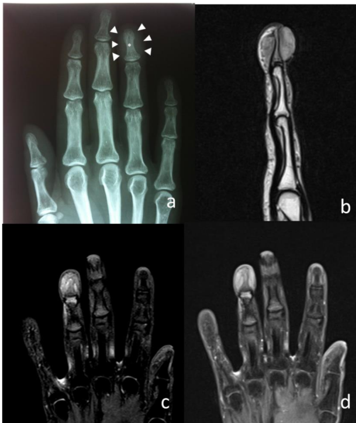
Figure 1 (a) AP radiograph. Medullary bone sclerosis, soft tissue swelling of distal phalanx of fourth finger. (b) Sagittal T2-weighted MR image. The medullary bone and soft tissue mass are hyperintense. (c) Coronal fat-saturated T2-weighted image also shows the lesion as hyperintense. (d) Contrast enhanced fat saturated T1 weighted axial plane image shows contrast enhancement of the soft tissue component of the lesion (asterisks).

heterogenous, rounded, soft tissue mass measuring 20 × 15 mm surrounding the volar and dorsal aspects of the right fourth distal phalanx. The lesion demonstrated hyperintense signal on T2-weighted and fat-saturated T2-weighted images (Figure 1b, c). Contrast-enhanced fat-saturated T1-weighted images showed significant contrast enhancement (Figure 1d). The bone cortex was not destroyed, but the medullary bone diameter was reduced compared with the other fingers. Based on the MRI findings, we made a presumptive diagnosis of a sarcomatous lesion.