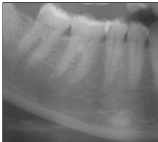
Figure 1: C1 category of MCI

MCI or KI refers to the appearance of the inferior cortex of the mandible and is classified as follows: C1: the endosteal margin of the cortex is even and sharp on both sides [Figure 1]; C2: The endosteal margin presents semilunar defects (lacunar resorption) and/or appears to form endosteal cortical residues on one or both sides [Figure 2]; and C3: The cortical layer forms heavy endosteal cortical residues and is clearly porous [Figure 3]. [17] Some studies have reported that women with a mild to moderate and severe eroded cortex are considered to have an increased likelihood of osteoporosis. [1,11,18-20] However, others indicated no usefulness of the MCI. [8,21,22] A recent study showed that approximately 95% of Japanese women identified by trained dentists using cortical shape findings did have osteopenia or osteoporosis. [14] As a result, studies concluded that the sensitivity of MCI in the diagnosis