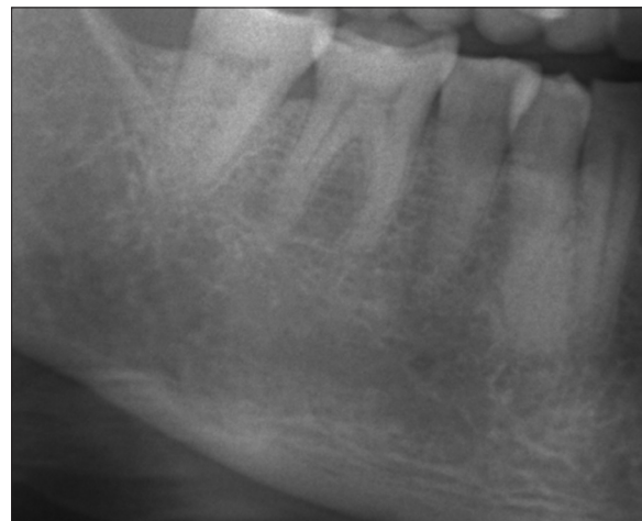
Figure 2: C2 category of MCI

PMI is the ratio between the cortical width at the mental foramen region and the distance from the lower border to the inferior edge of the mental foramen (MI/h) [Figure 4]. [37] A few studies investigated the accuracy of PMI in detecting reduced BMD. These studies considered the threshold value of 0.3 and the estimated sensitivity and specificity was higher than 70%. [8,20,38]