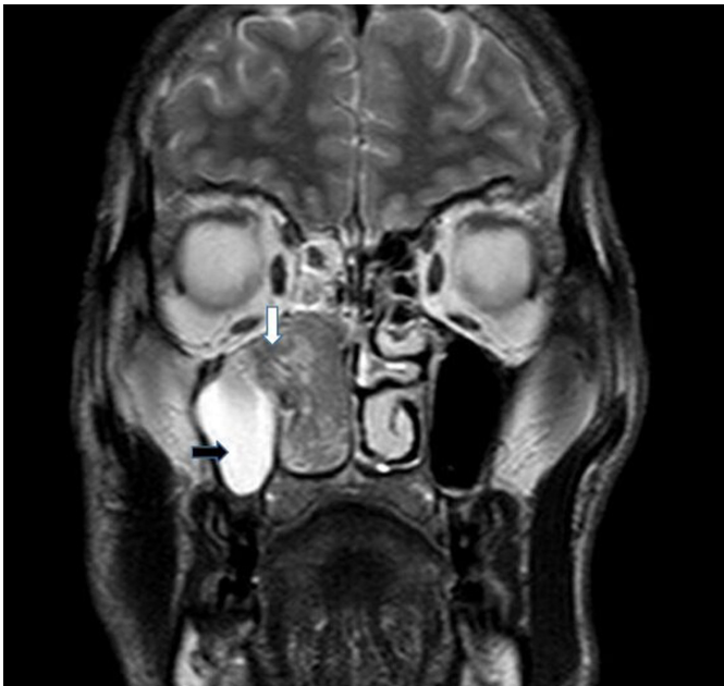
Figure 2. T2 weighted axial magnetic resonance imaging section White arrow: Convoluted cerebriform pattern; black arrow: Opacity owing to stenosis and inflammation