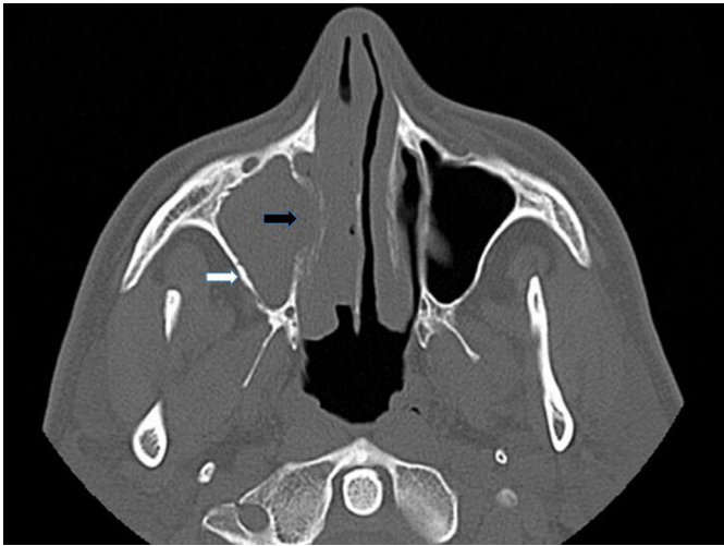
Figure 1. Axial computed tomography section White arrow: Osteitis at the lateral wall of maxillary sinus; black arrow: Tumor spread through the nasal cavity

Twenty-nine patients with SIP were detected at the initial evaluation. Three patients who underwent revision surgery and