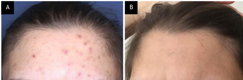
Figure 2 Case 2, (A), Erythematous and excoriated papules, and hyperpigmented macules on the forehead of the patient with acne excoriée. (B), Complete clinical improvement after 6-weeks on N-acetylcysteine treatment.

the article and revising it critically for important intellectual content; final approval of the version to be submitted.